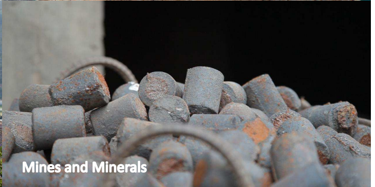
Mines and Minerals